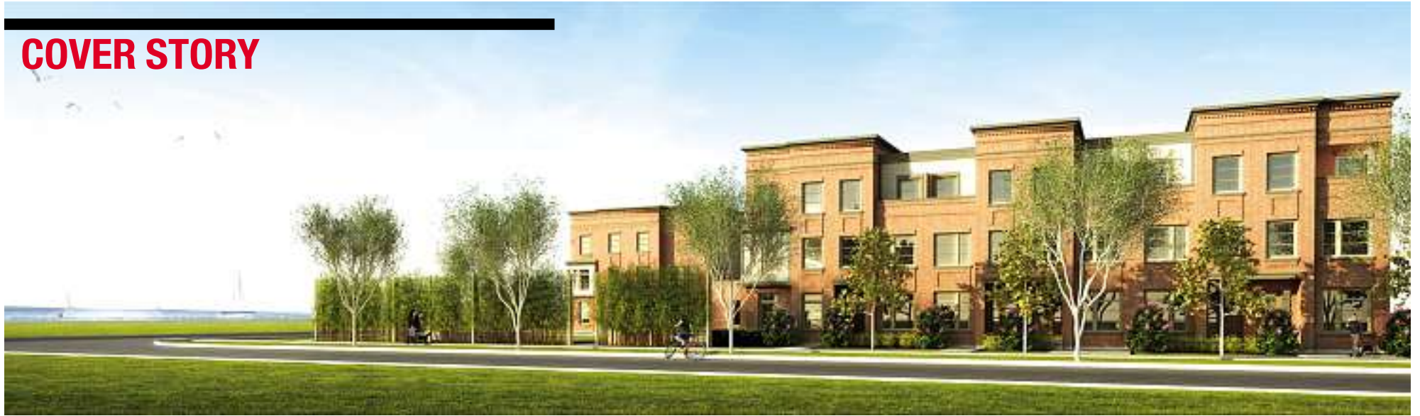
Above: Shorelands three-storey townhomes. Below left: Interior of a Shorelands LEED home. Below right: Christmas tree at the Shorelands presentation centre.